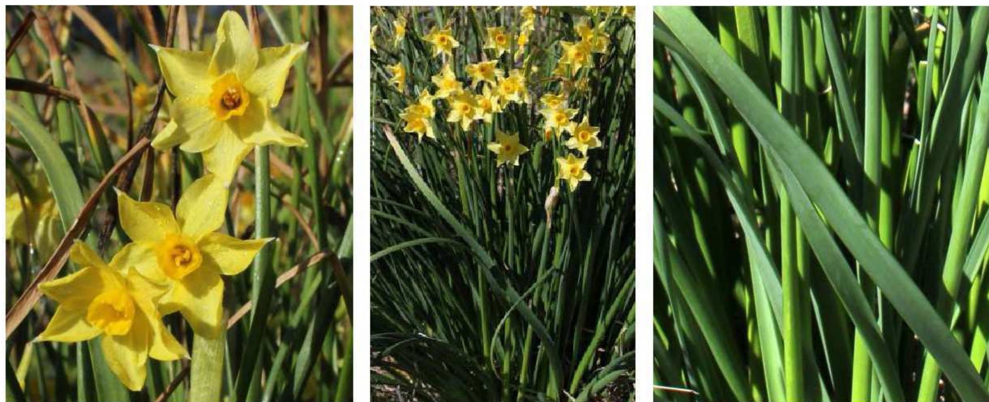
Figure 7. Narcissus jonquilla , roadside, Macon Co., Alabama, 7 Mar 2014.

Roadsides, fields, power line right-of-ways, and old home sites; common on the coastal plain, infrequent in the Appalachian Highlands; February–March. This sterile hybrid spreads through asexual production of bulblets (Nesom 2010). It is often confused with Narcissus jonquilla , but N. × intermedius can be distinguished by its channeled, concaved leaves that are mostly over 4 mm wide and has a darker orange corona contrasting with lighter yellow tepals. This hybrid's thick leaves, which are swollen and grooved, are intermediate between its parents, N. jonquilla and N. tazetta . [GA, MS]